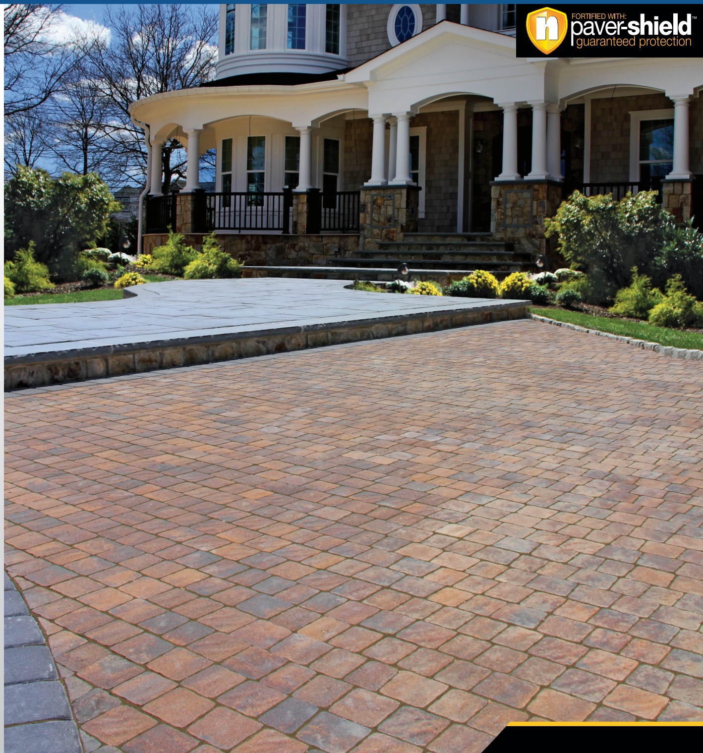
THE MONTAUK: Oyster Blend Walkway: Alpine Ridge in Pennsylvania Blue (Random Pattern)