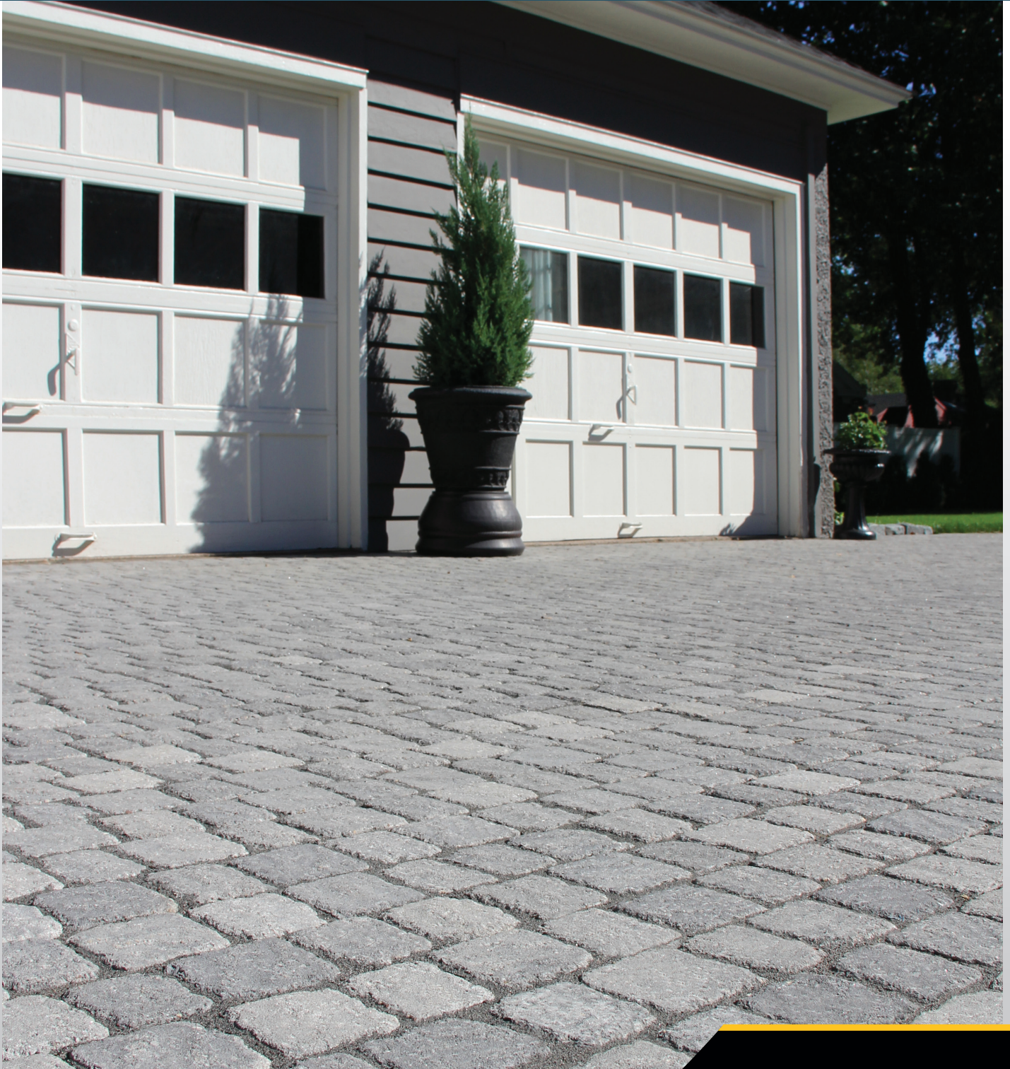
POMPEII: Granite City Blend (Running Bond)