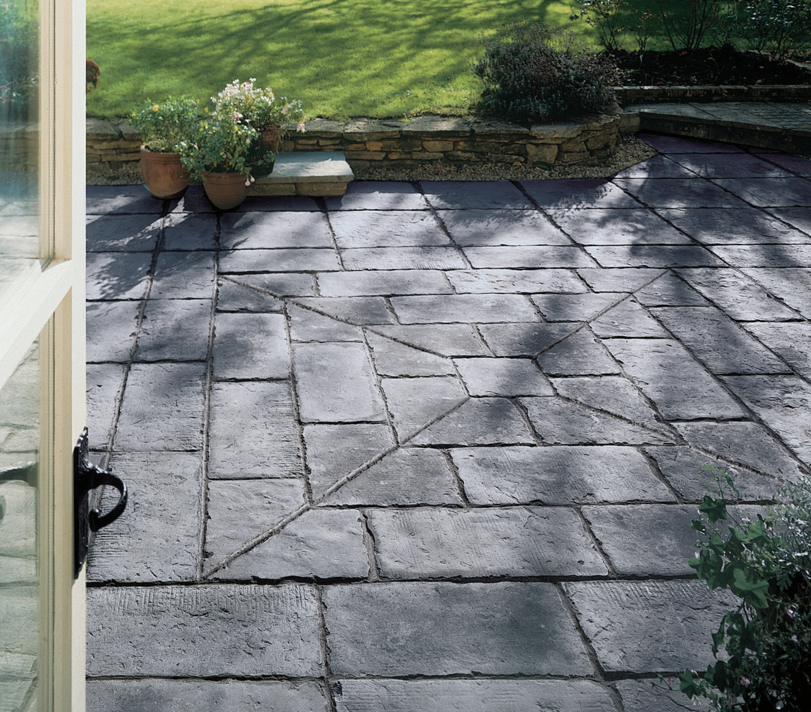
Old Town Flagstone Quartered Square | Color: Bluestone