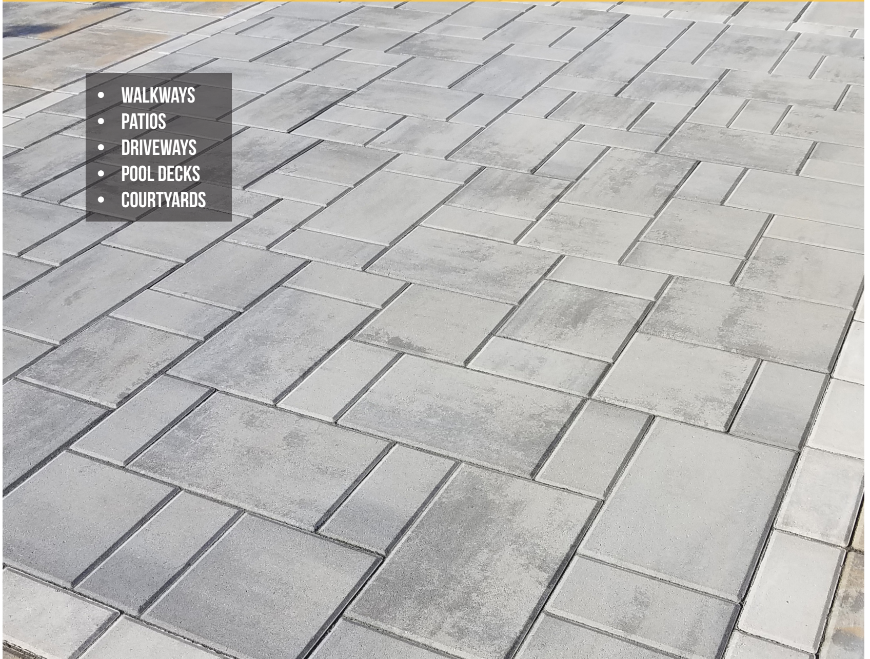
Stone Ridge Contemporary | Color: Granite City Blend